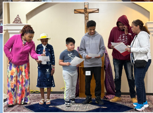
OCIA and Confirmation Retreat on March 7.