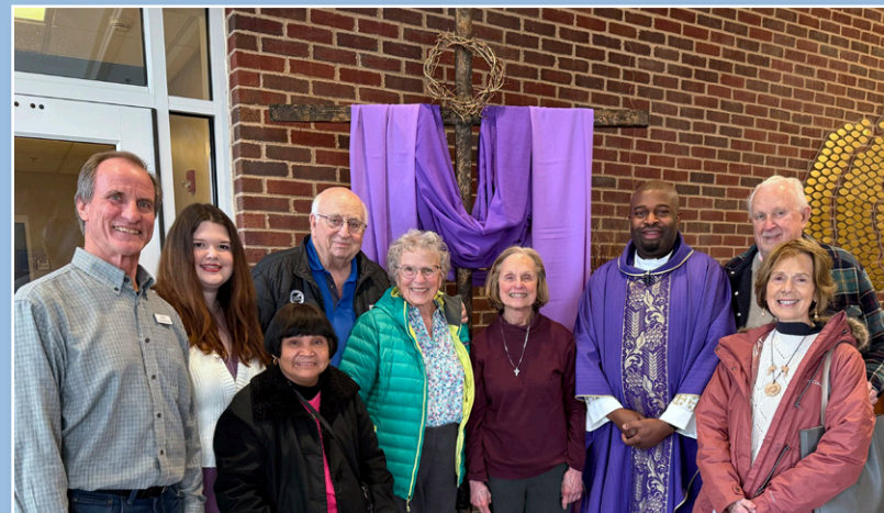
Pilgrim Trail from Holy Spirit Parish Newman Center.